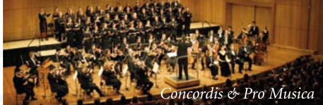
Concordis & Pro Musica